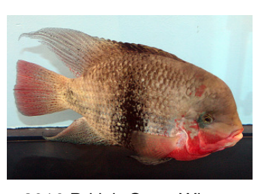
2016 British Open Winner

(Fishes gaining 'Best in Shows' from any Open Show in 2017 qualify for this end-of-the-year 'Heads-to-Heads' Final shootout)