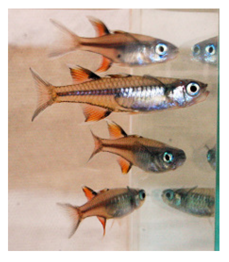
Four of a kind, or, Familiarity breeds! (2017 Breeders' Classes winners qualify)