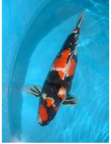
'Big is Beautiful' so they say.

Apart from admiring their beauty, spare a thought on the effort required to get fish into this condition and get them to the Show as well!