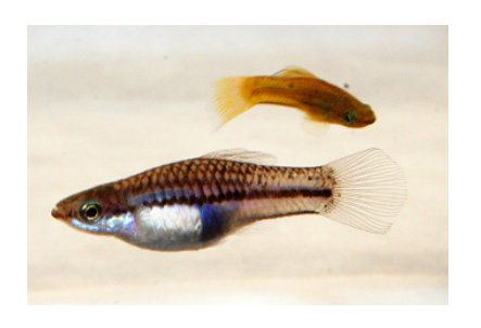
Favourite twosomes. Or fishkeeping's equivalent of 'Mr & Mrs' (2017 Pairs Classes winners qualify)